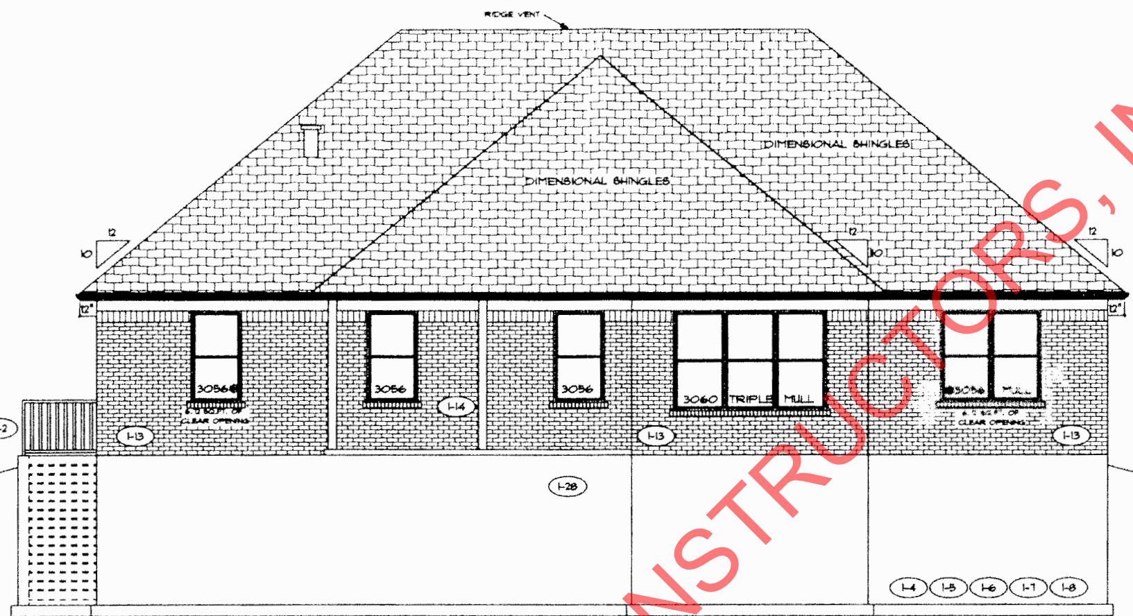
NOTE: STOOPS, STEPS, APRON AND DRIVE BY OWNER REAR ELEVATION 16" FOOTER WIDTH MIN.