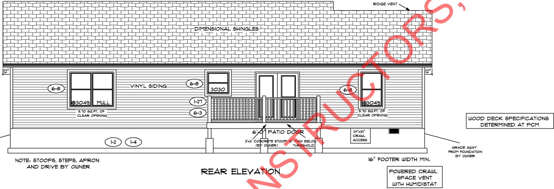
NOTE: STOOPS, STEPS, APRON AND DRIVE BY OWNER REAR ELEVATION