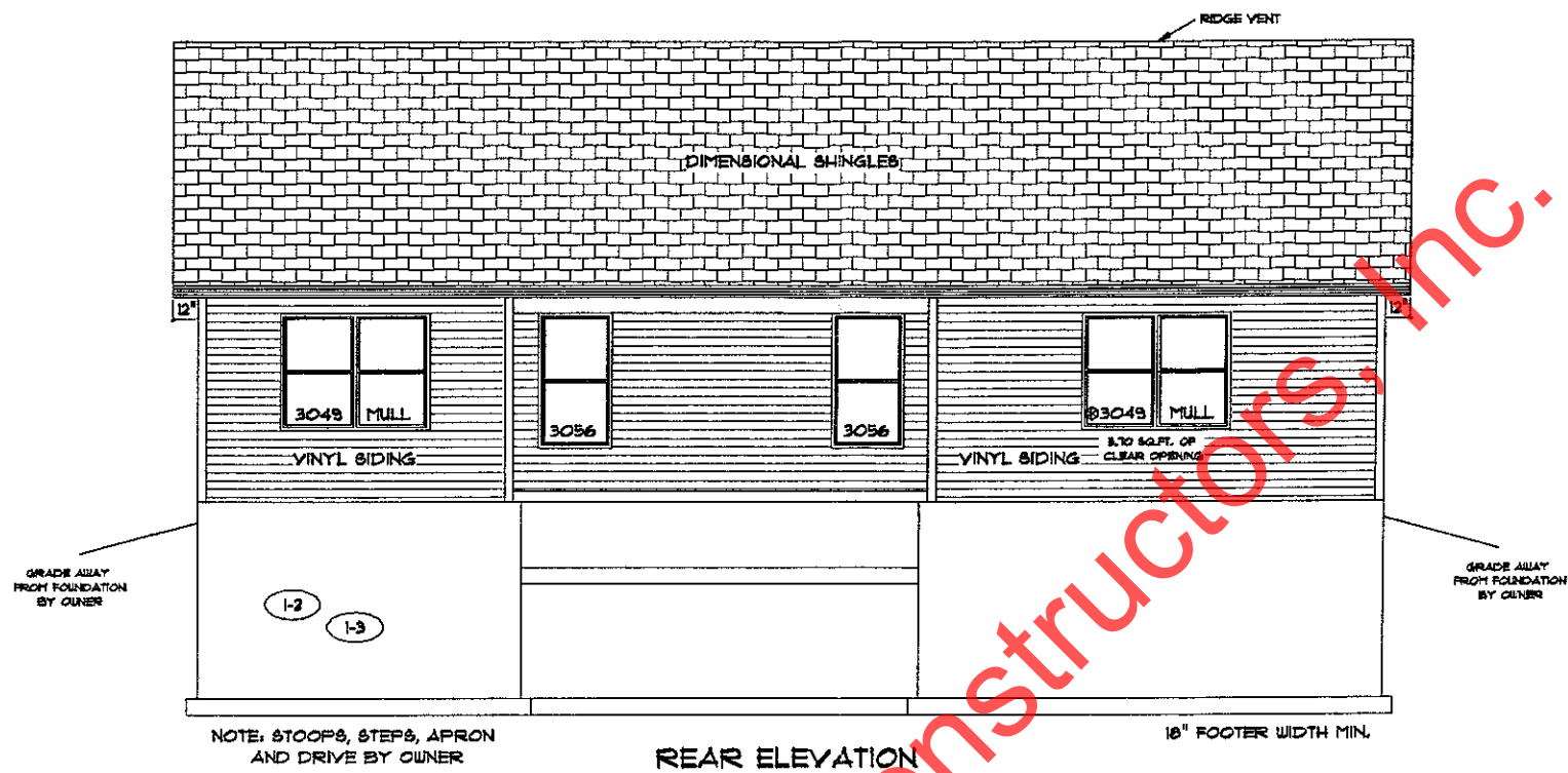
NOTE: STOOPS, STEPS, APRON AND DRIVE BY OWNER REAR ELEVATION 18" FOOTER WIDTH MIN.