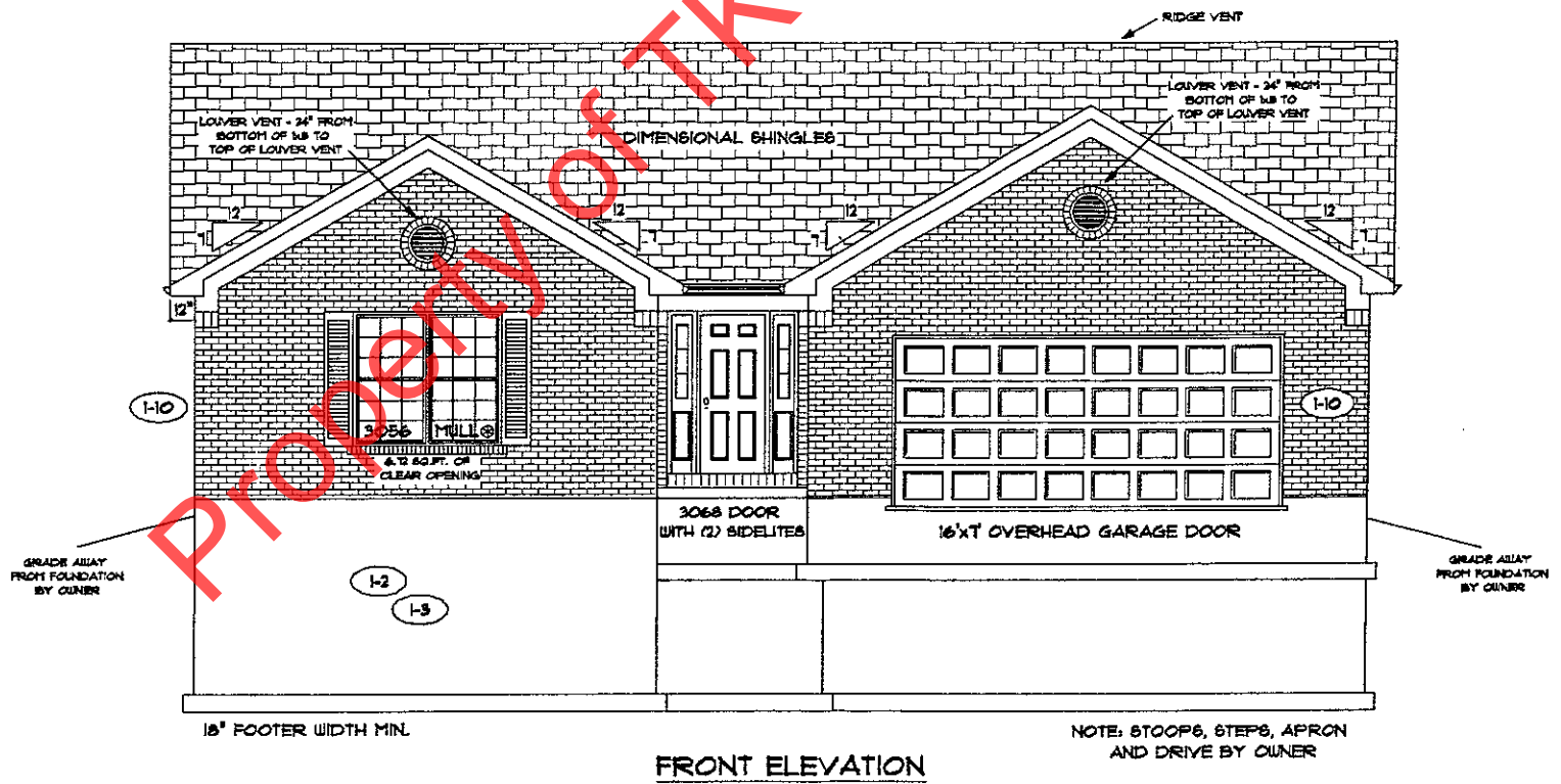
18" FOOTER WIDTH MIN. FRONT ELEVATION NOTE: STOOPS, STEPS, APRON AND DRIVE BY OWNER