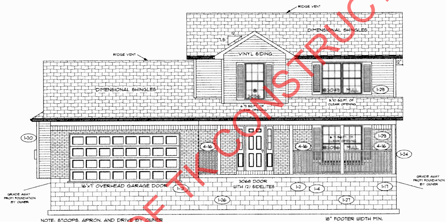
NOTE: STOOPS, APRON, AND DRIVE BY OWNER FRONT ELEVATION 18" FOOTER WIDTH MIN.